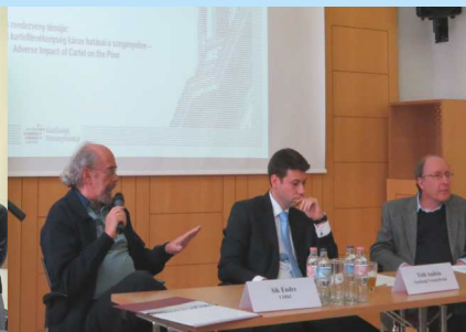
Competition Promotion and Consumer Protection Directorate (CPCPD), Afghanistan witnessed the celebration of WCD (2013)